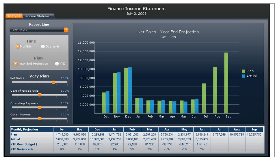
Figure 3: Income Statement Template