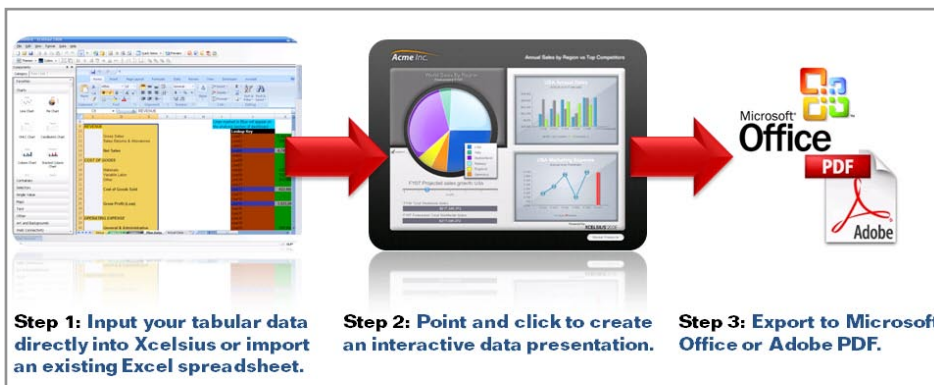
Figure 4: Xcelsius® Present Workflow

Use Xcelsius Present software to engage, inform, and persuade your audience with dynamic visualizations and interactive presentations.